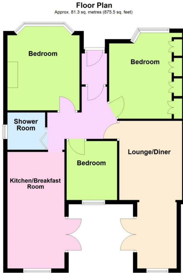
Total area: approx. 81.3 sq. metres (875.5 sq. feet)